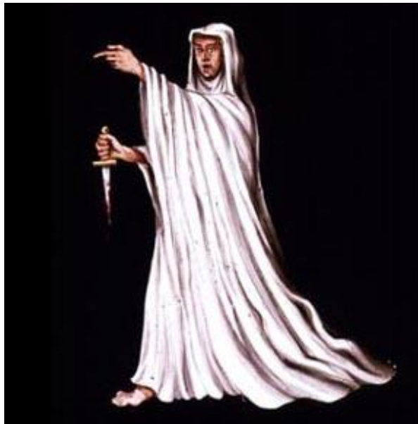
8. The Bleeding Nun of Lindenberg, a coloured slide from Etienne-Gaspard Robertson's Phantasmagoria . Available from http://users.telenet.be/thomasweynants/phantasmagorie2.html

In Raymond and Agnes; The Travellers Benighted the fluttering white fabric of Agnes's gown further evokes the suggestive stage costume created for the ghost of Evelina in The Castle Spectre , described in the list of costumes for the performance as "a plain, white muslin dress, white head dress, or binding under the chin, light loose gauze drapery." 177 The Bleeding Nun costume, "White muslin – beads, cross and dagger", was itself codified, and became part of the standard visual lexicon of the female ghostly apparitions which transmogrified from visual code to visual code. An instance of the re-mediation of the Nun's costume is given by a surviving Gothic slide from Etienne-Gaspard Robertson's Phantasmagoria at the Convent des Capuchines, Paris (approx. 1799) (Fig. 8). 178