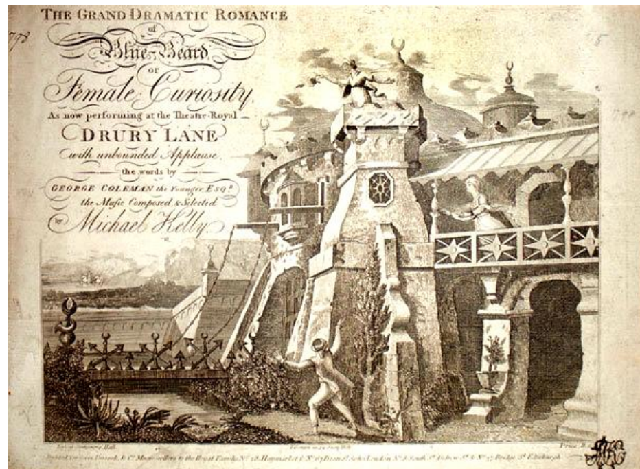
9. George Colman, The Grand Dramatic Romance of Blue Beard, or, Female Curiosity , Available from http://www.cph.rcm.ac.uk/Virtual%20Exhibitions/Music%20in%20English%20Theatre/Pages/Caption4.htm

As the perfect models of Gothic architecture, castles can be considered a scenographic specimen of the way in which the complex Gothic dramatic text worked. The special effects they permitted (e.g. explosions or the collapsing of stage elements) showed the close cooperation of scenic artists, machinists and the acting-manager. On-stage turrets, bridges and similar architectural projections were practicable three-dimensional structures, which could be scaled or crossed by the players and the extras, as shown in the advertisement for Bluebeard (Fig. 9).