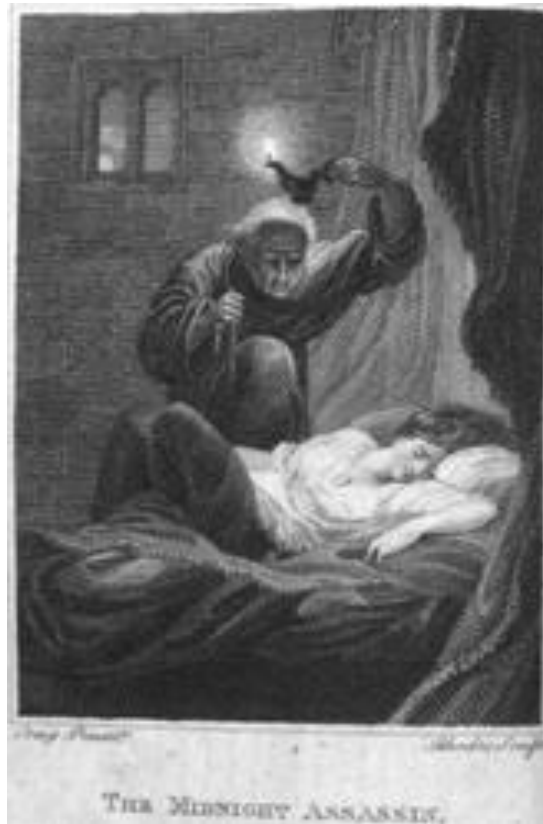
10. Frontispiece. The Midnight Assassin; or, the Confessions of the Monk Rinaldi, containing a complete history of his diabolical machinations and unparalleled ferocity (1802,) chapbook version of The Italian . Available from http://www.lib.virginia.edu/small/collections/sadleir-black/goldapx.html

As shown in the frontispiece of The Midnight Assassin , which follows almost verbatim Radcliffe's hypotext as well as Boaden's stage directions, the mammary iconography put on show both woman's feeling heart and her seductive body, underlining at the same time her sexuality as well as her vulnerability. In the illustration from The Midnight Assassin the spectacle of feminine helplessness is increased by the light chemise dress in cotton and muslin worn by Ellena. The disarray in which she is depicted crucially uncovers –right at the centre of the picture- the all-important miniature, at one and the same time the icon and the index of Ellena's identity and family history. Also, the unambiguous chromatics