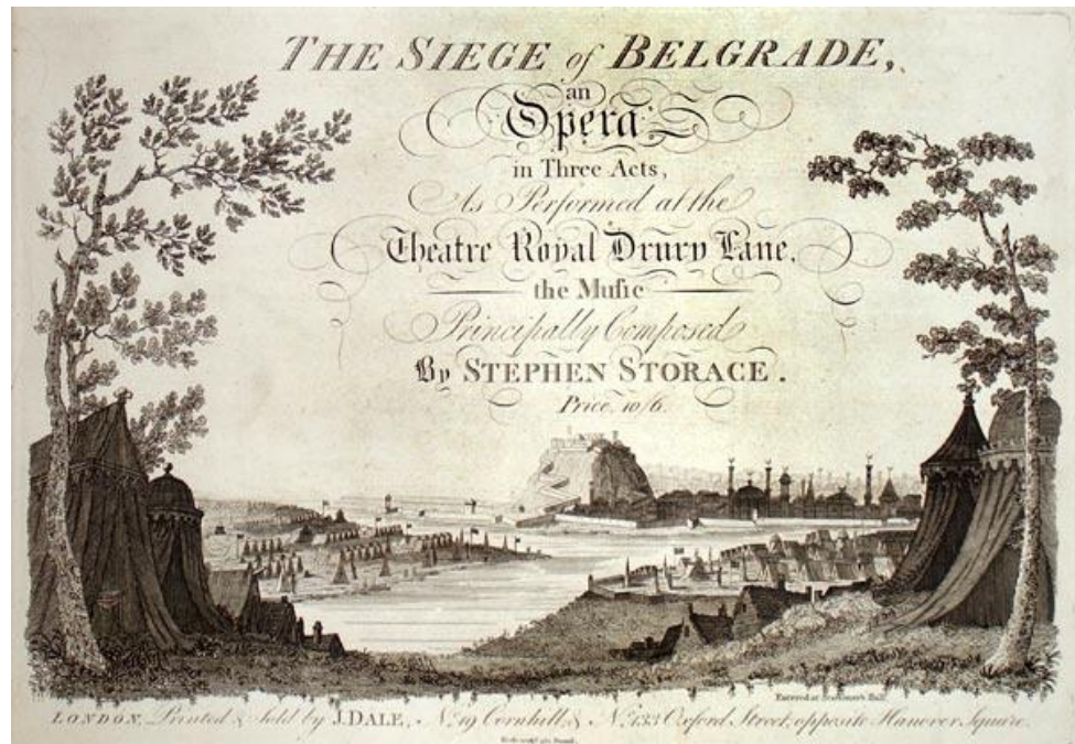
6. James Cobb, The Siege of Belgrade; an Opera in Three Act, as performed at the Theatre Royal Drury Lane , (London: printed & sold by J. Dale, [1791]) RCM Library, H380/2. Available from http://www.cph.rcm.ac.uk/Virtual%20Exhibitions/Music%20in%20English%20Theatre/Pages/Caption6.htm

iconographic document argues for the relevance of illusionism in terms of the drawing potential of a performance.