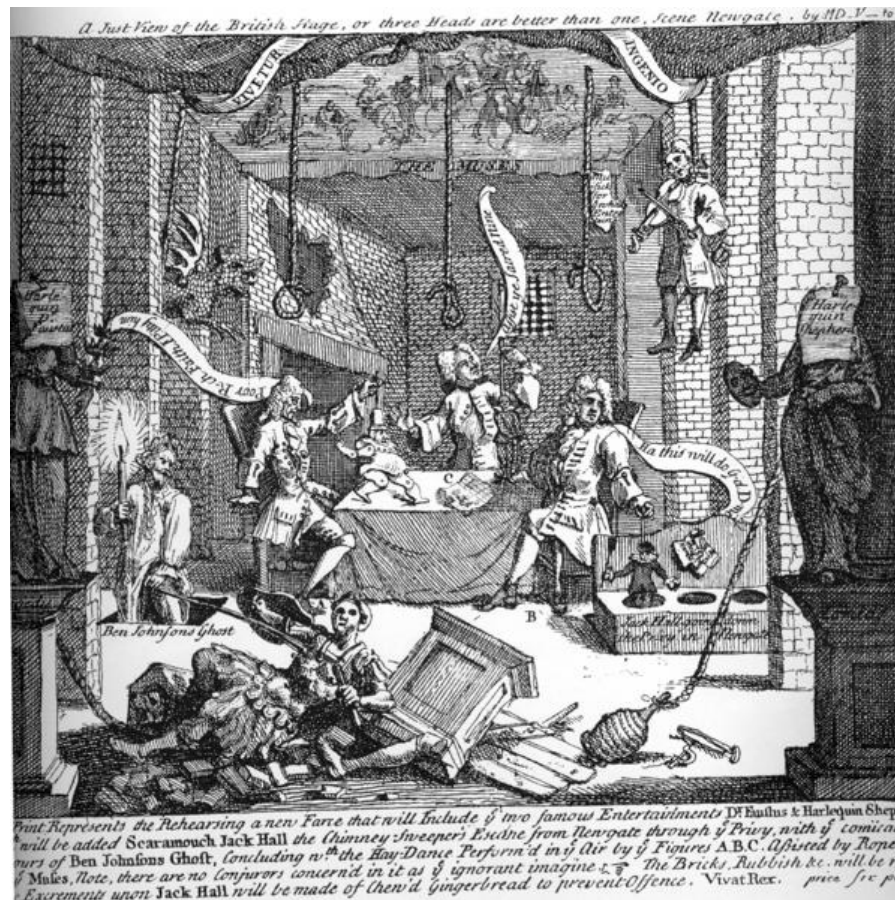
2. William Hogarth, “A Just View of the English Stage” (engraving, 1724).

Approaching the end of the century, the attack shifted to the new genre of sensational drama, which allegedly provided merely low ‘bodily’ enjoyment, instead of a higher form of aesthetic pleasure mediated through elevated emotions and pathos . Sensational shows, and Gothic shows in particular, thus received mostly negative critical attention. Not surprisingly, even the most successful dramas of the 1790s, such as Lewis’s The Castle Spectre , did not provide an