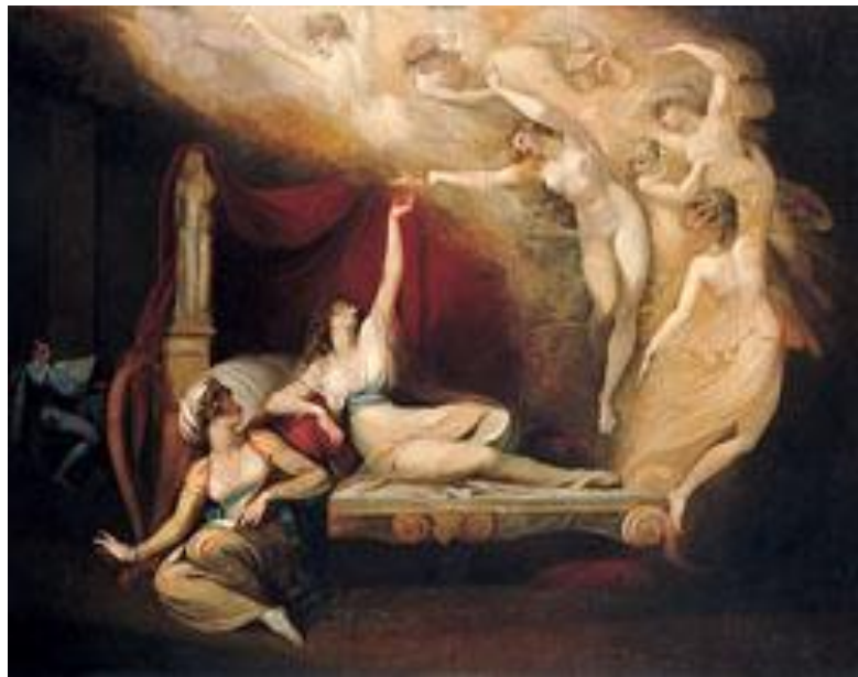
11. Henry Fuseli, Queen Katherine's Dream , exhibited 1781 (Fylde Borough Council). Available from http://www.tate.org.uk/britain/exhibitions/gothicnightmares/rooms/room6.htm

As we have already noted in our survey of coeval criticism of Gothic, “effect” was one of the favourite terms to describe the theatre of the 1790s. In his biography of John Philip Kemble Boaden states that the vision that comes to Queen Katherine in Act IV, scene ii of Henry VIII had been excellently illustrated by Henry Fuseli (Fig. 11). Also in this case the term that seems to capture the essence of the product is the same: “Look at the effect of these circling and ascending spirits in Mr. Fuseli’s picture of the scene,” are the words with which Boaden instructs his Ideal Reader. 7