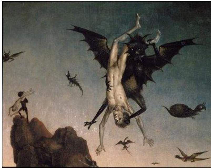
13. Dirk Bouts the Elder, the Fall of the Damned . La chute des damnés . Approx. middle of the XV cent. Musée des Beaux-Arts, Lille (France).

the monk with eternal damnation in a sublime and terrifying tableau which adapts to the page the rich tradition of medieval and renaissance iconography of “the fall of the damned” (from Dirk Bouts the Elder to Bosh to Rubens, Fig. 13).