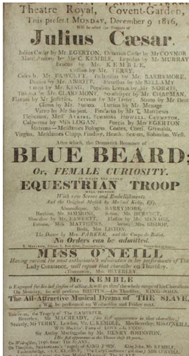
1. Playbill for a performance of Blue Beard on 9 December 1816, Theatre Royal Covent Garden. Centre for Performance History. Available from http://www.cph.rcm.ac.uk/Virtual%20Exhibitions/Music%20in%20English%20Theatre/Pages/Caption4.htm

This archival evidence shows that the Morning Post reviewer had failed to grasp the epistemic import of the arrival of the real on stage—real horses, real elephants, real processions—signs and tokens of a new kind of ‘profane’ drama, harking back to opera, another heavily criticised kind of ‘verisimilar’ performance which