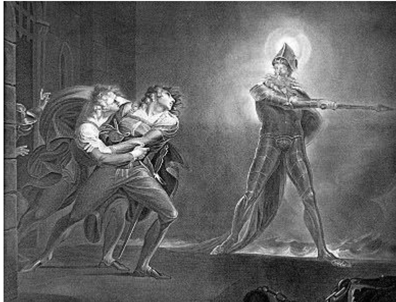
12. Hamlet . Act I. Scene IV. "Hamlet, Horatio, Marcellus, and the Ghost." Painted by H. Fuseli, R. A. Engraved by R. Thew." Plate XLIV from Volume II of Boydell's Shakespeare Prints . Based on the original painting of 1789. Available from http://shakespeare.emory.edu/illustrated_showimage.cfm?imageid=73

In the passage above Boaden touches on two precise visual components of Fuseli's painting: the grand posture of the ghost and the lighting effects which illuminate it with eerie hues. In so doing, we may argue, he suggests a dramatic reading of the picture –a theatrical interpretation that firmly places it in the context of contemporary scenography, acting techniques and, quite symptomatically, also of the late eighteenth-century Shakespearian criticism. This is precisely the striking visual effect Boaden strove to recall in Fontainville Forest .