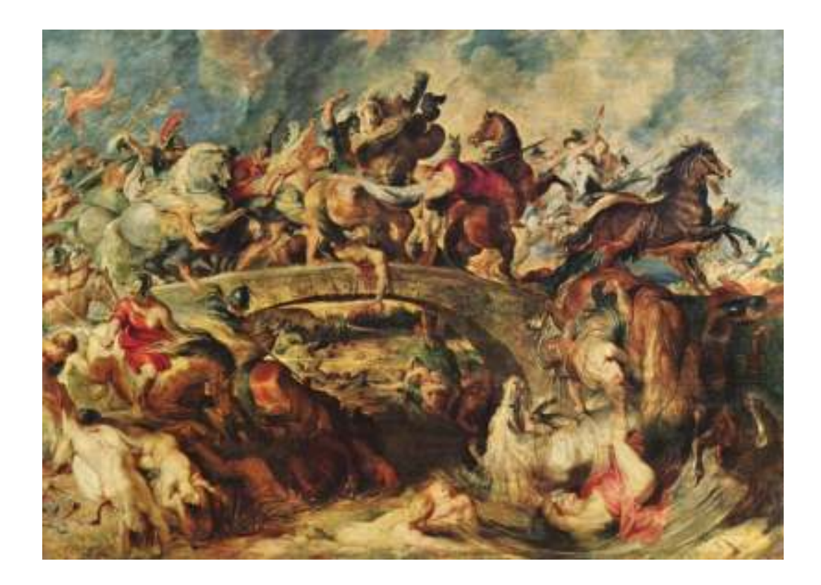
FIGURE 4: Pieter Paul Rubens, The Battle of the Amazons, c. 1615.