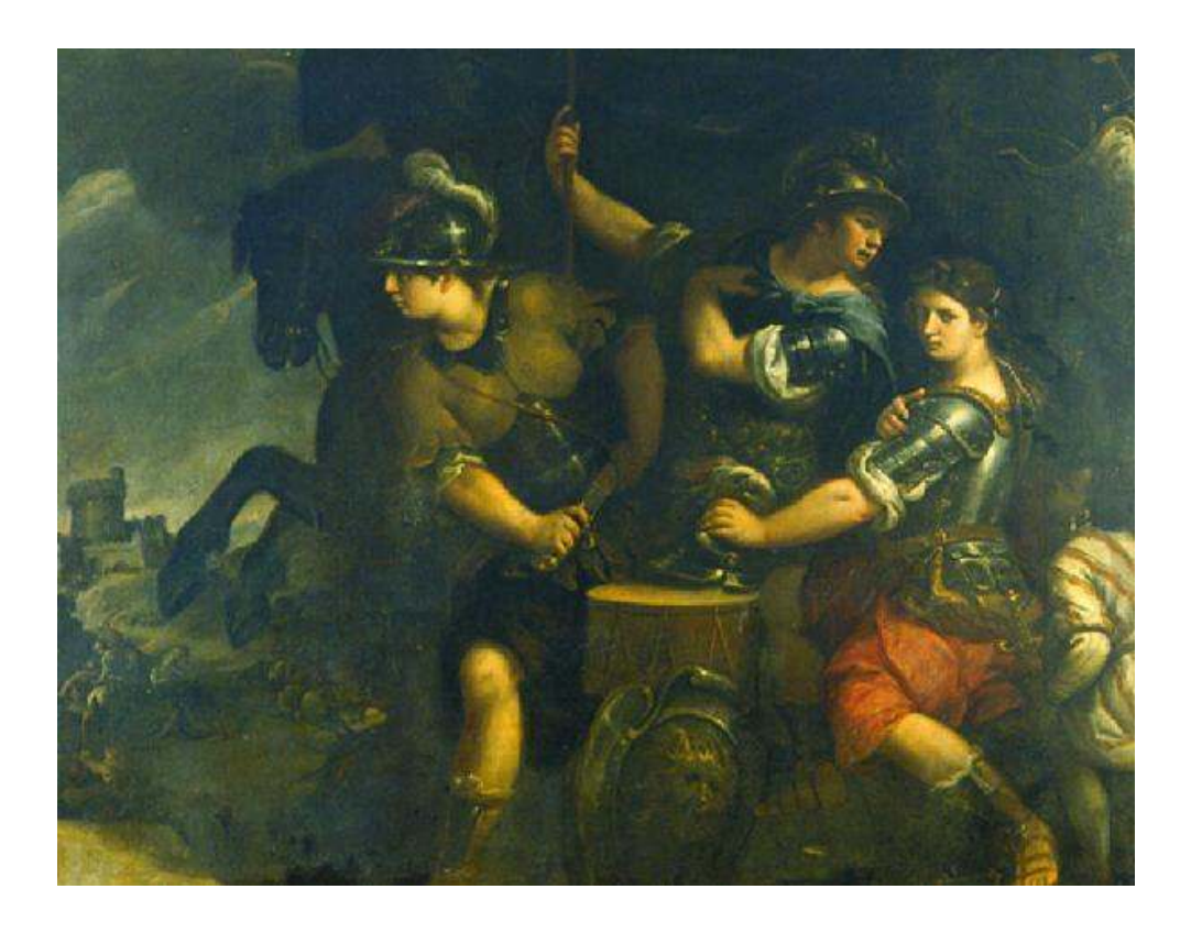
FIGURE 8: Giuseppe Nuvolone (attributed to), Amazons Preparing for the Battle, c. 1650.

Orsames' political aspirations for most of the plot. Cleomena's assertion of 'femininity' in the first act forecasts the suppression of her gender anomaly at the end of The Young King ; even so, she represents a challenge to the patriarchal system all through.