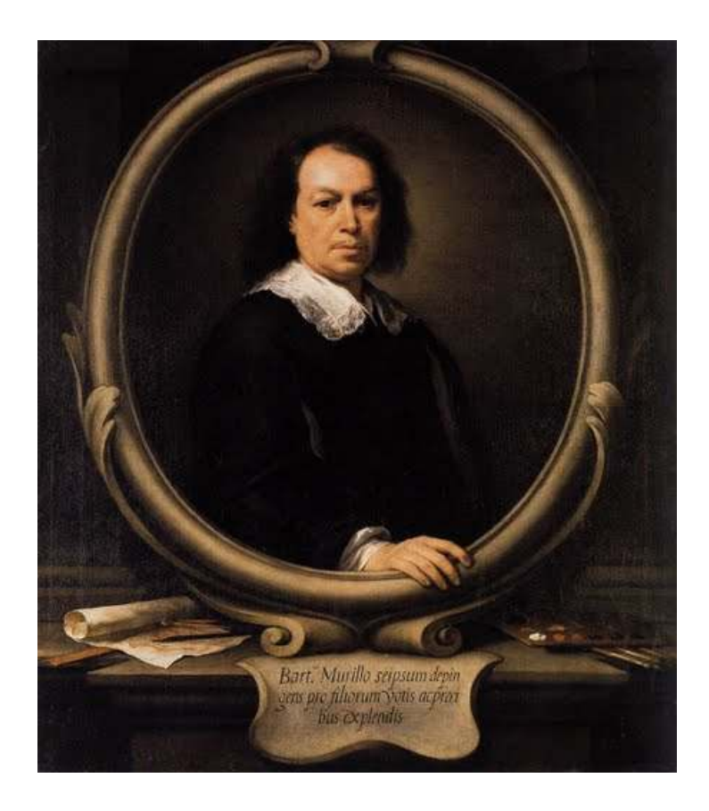
FIGURE 2: Bartolomé Esteban Murillo, Self Portrait, c. 1670-73.

Lord [...] it is advisable to remove his sight from such a dangerous diversion' (Núñez de Guzmán 1672:389b, quoted in O'Connor 2000:63, emphasis added).<sup>41</sup>