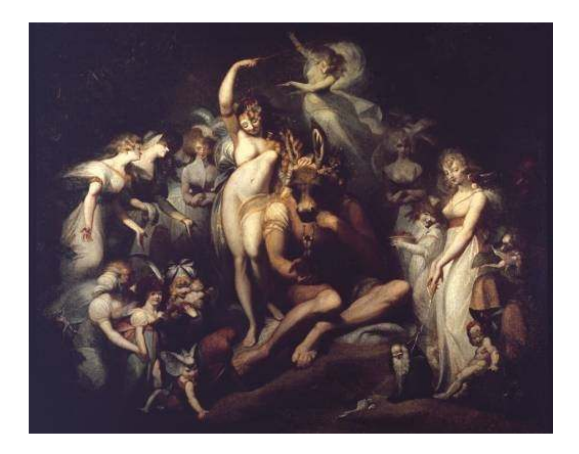
FIGURE 5: Henry Fuseli, Titania and Bottom, c. 1790.

of sight and hearing ('Mine ear is much enamoured of thy note; / so is mine eye enthralled to thy shape') (III.i.131-132). Her words repeatedly list the delights that will please Bottom's (and perhaps the audience's) sensorial perceptions during the dreamlike spell (in the third act 'jewels', 'pressèd flowers', 'apricots and dewberries', 'honeybags', 'painted butterflies'; in the fourth act 'musk-roses' and 'new nuts') (III.i.149-163 and IV.i.3-35). Importantly, also Titania's love dream is more real than unreal: as the Fairy Queen is momentarily in love with a real ass-headed man, Hermia and Helena love two 'monsters' who alternately humiliate them in Athens as well as in the woods. Bottom's hyper-visible ass-head exemplifies the young men's unworthiness, while Titania's infatuation reminds one of the two women's obstinacy: 'reason and love keep little company together nowadays' (III.i.136-137).