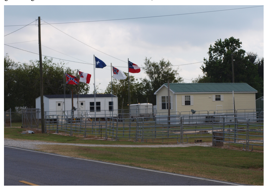
Image 6: Flags of the Confederate States of America, flown in Buras.