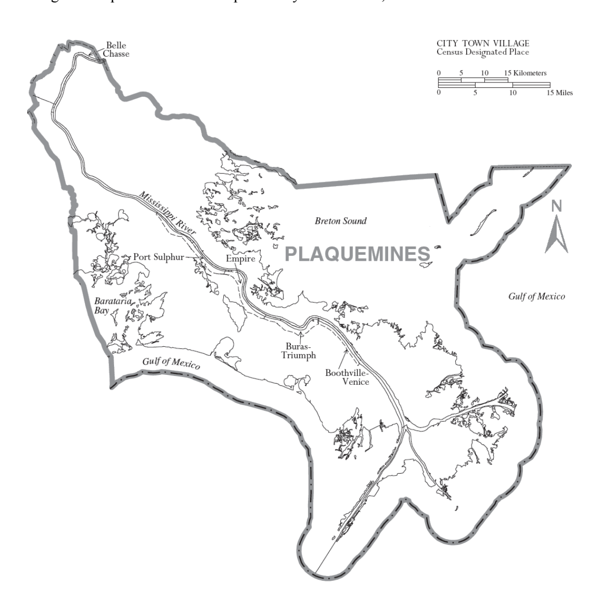
Image 2: Plaquemines Parish map with key towns noted

Buras), and three towns further north; Empire, Nairn, and Port Sulphur (see Image 2 below). I consider these four communities to constitute my 'primary' field site. I gathered additional data in the northern town of Belle Chasse and on the east bank of the Parish in the town of Port à la Hache. Several interactions and interviews also took place beyond the Parish border, in New Orleans, Gretna, Lafayette, Baton Rouge and Galliano in Louisiana, in Bay St. Louis and Gulfport in Mississippi and Tuscaloosa in Alabama. Given the heavily publicised nature of both the BP oil spill and Hurricane Katrina, I continued my observation of how these disasters were being presented in the mainstream press even after I returned from the field.