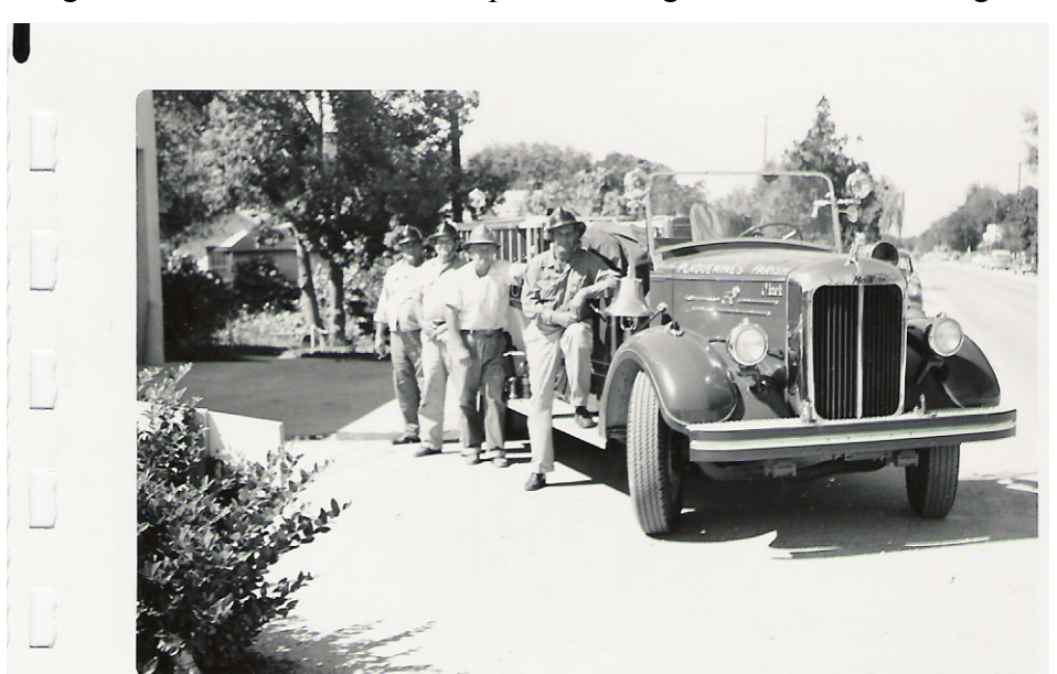
Image 5: Buras Volunteer Fire Department original members and engine.