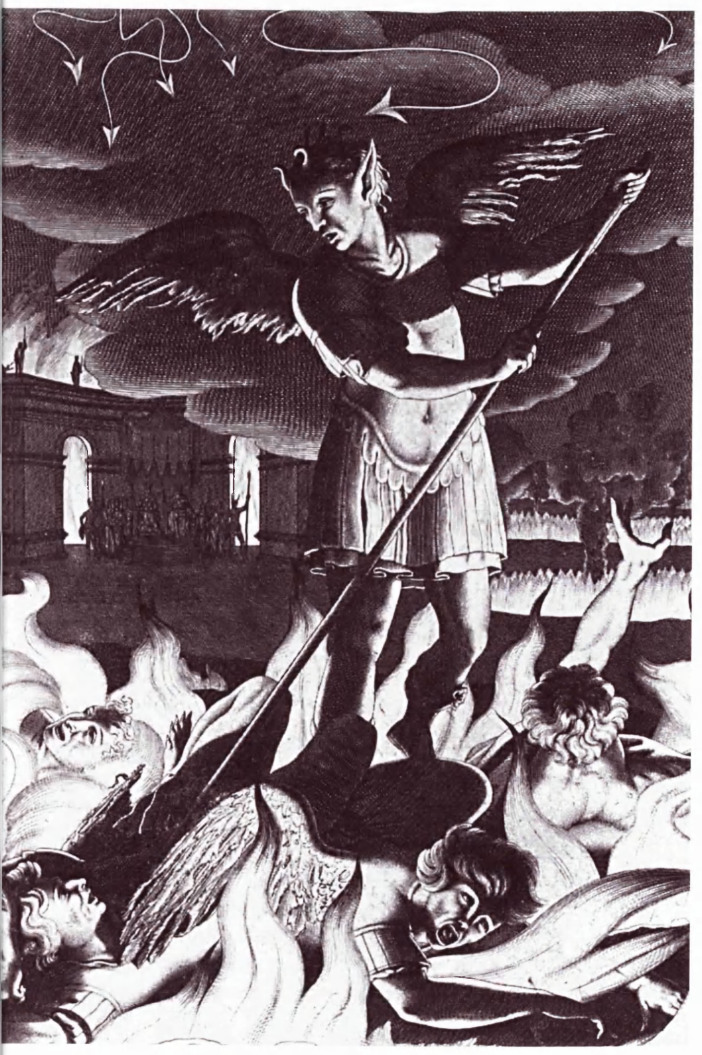
Illustration I: Anon., 'Satan Summons His Legions'