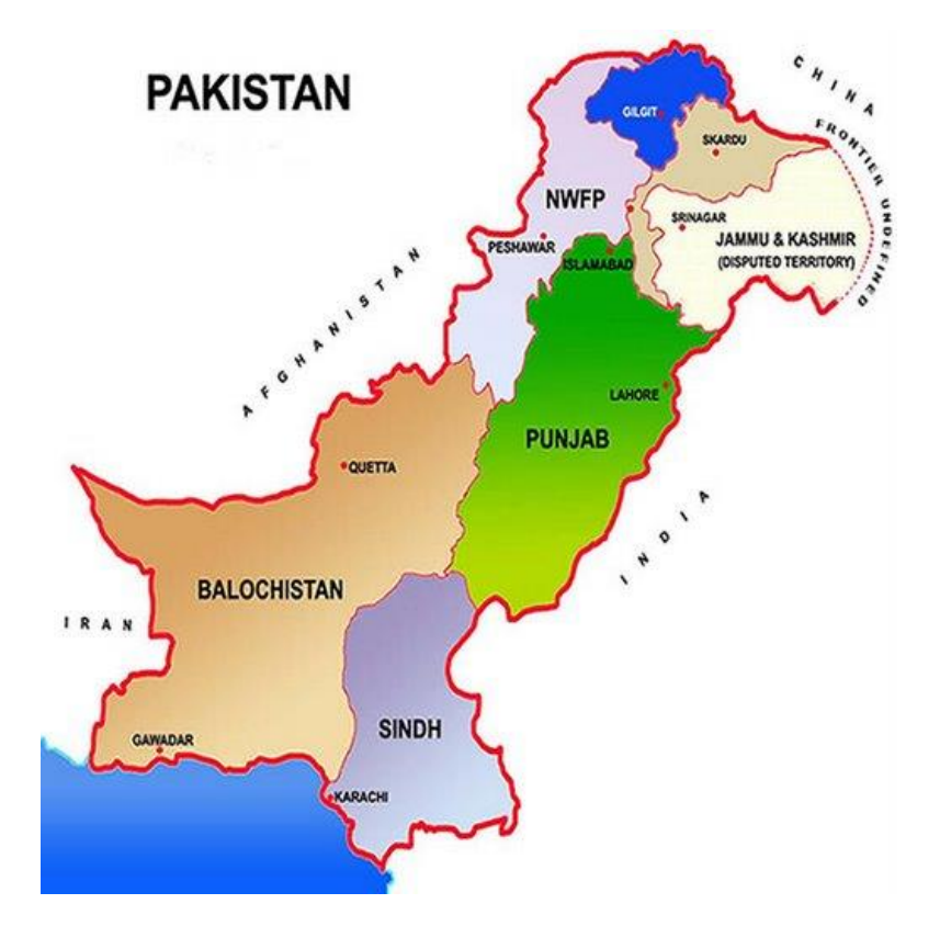
Figure 1.3: Provincial Map of Pakistan

Thus, Muslims in limited numbers started learning English, especially to acquire jobs in government institutions and for business. As a result of this, by the time independence was granted to India and Pakistan in 1947, there was no language in use other than English for running the official matter of state (Mahboob, 2002, p. 2). It was decided that English would retain the status of the official language but only until the national language could replace it within all the sectors of the state. However, perhaps, due to the global spread of English for international communication and the rapid growth of knowledge in science and technology (Schneider, 2011; Sharifian, 2009), Urdu has not equipped itself as a suitable substitute for English (Bhatt and Mahboob, 2008). In this connection, I am particularly interested to explore the attitudes of university students from two provinces, Sindh and Balochistan. With the historical background in mind, this study focuses on the attitudes of learners of English as a foreign language at the tertiary level in two provinces of Pakistan: Sindh and Balochistan.