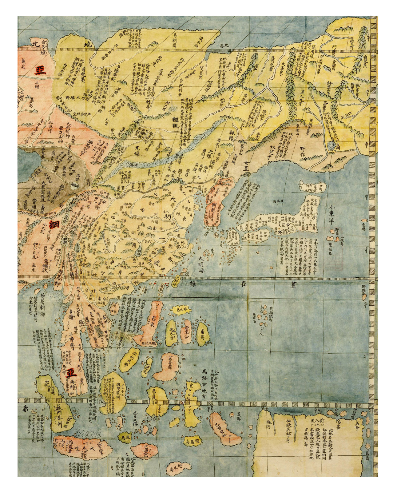
Figure 2 Matteo Ricci's A Map of the Myriad Countries of the World (坤輿萬國全圖, 1602), which was the first Chinese map indicating China as an 'Asian' (亞細亞) country.